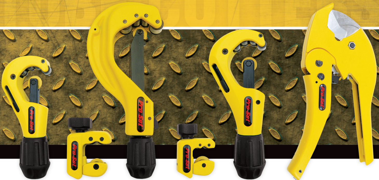
TCT274 1/8" - 1 3/8" (3 TO 35MM)