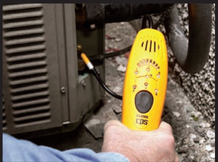
Detects all CFC, HFC, HCFC, SF6 gases and blends