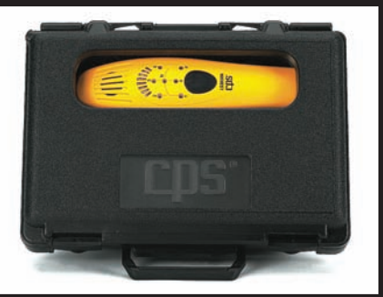
Rugged carrying case included